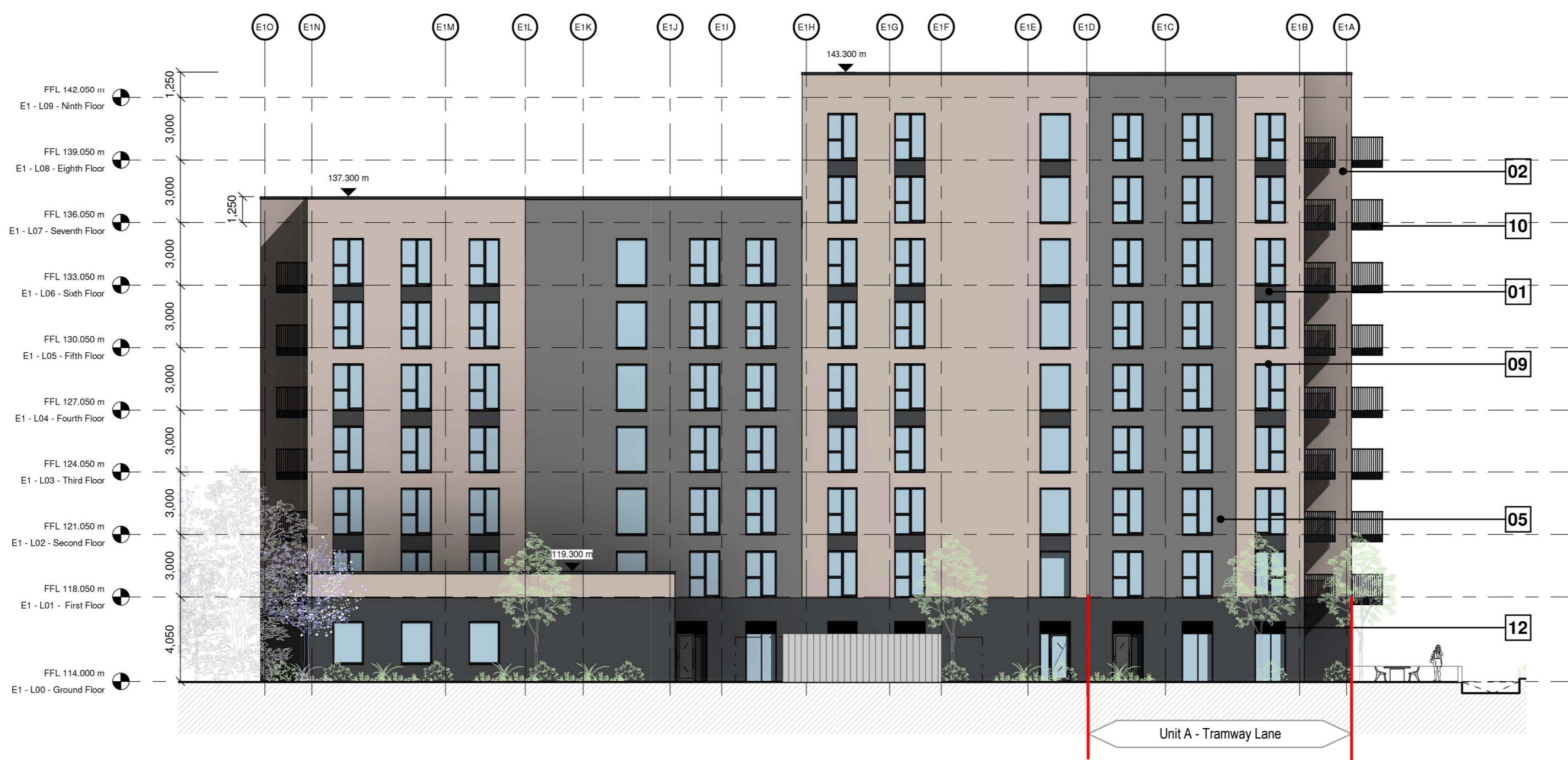
1 North Elevation - Unit A - Permitted under ABP-310570-21 1 : 200