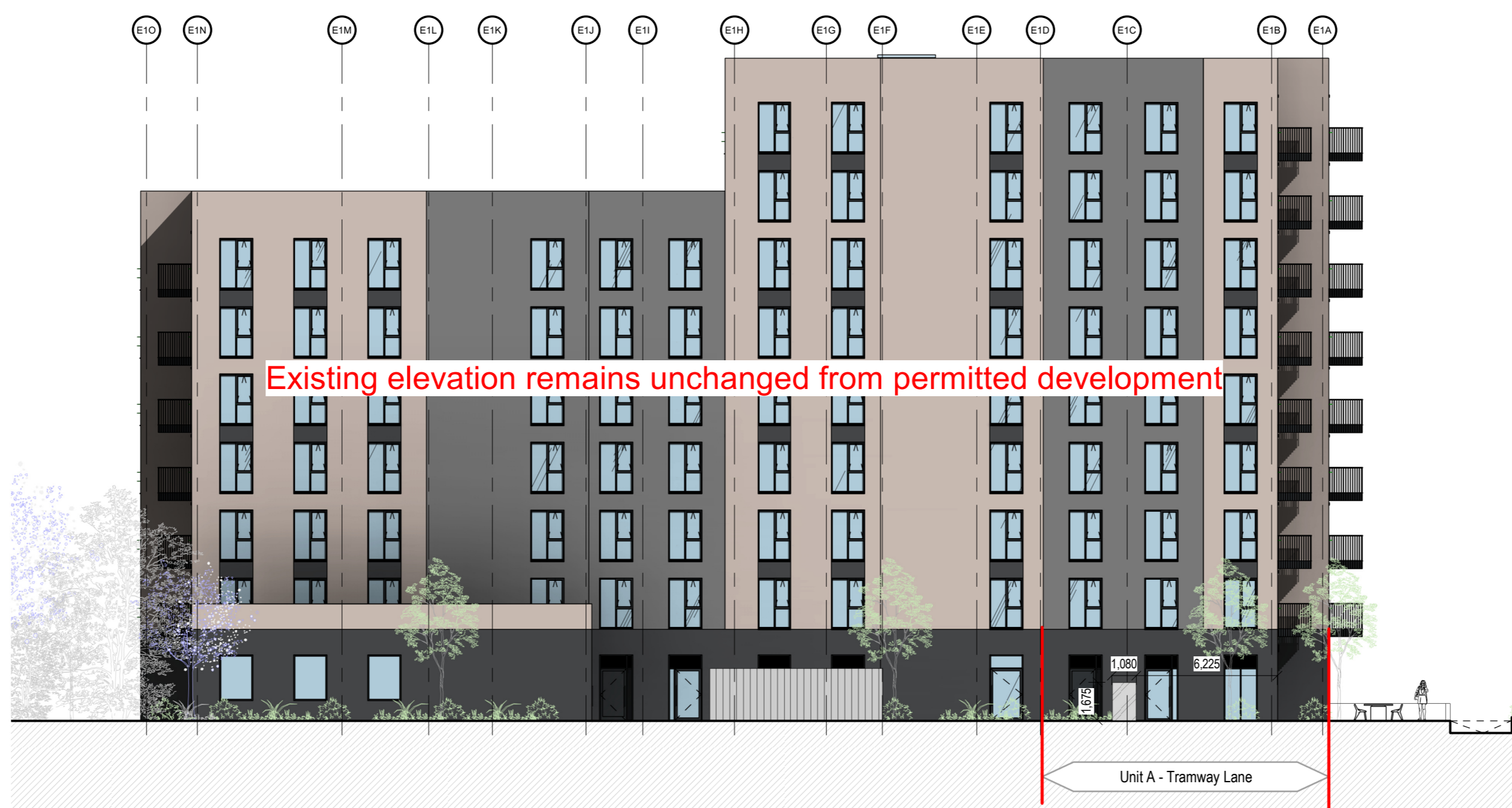
2 North Elevation - Proposed Unit A Tramway Lane 1 : 200