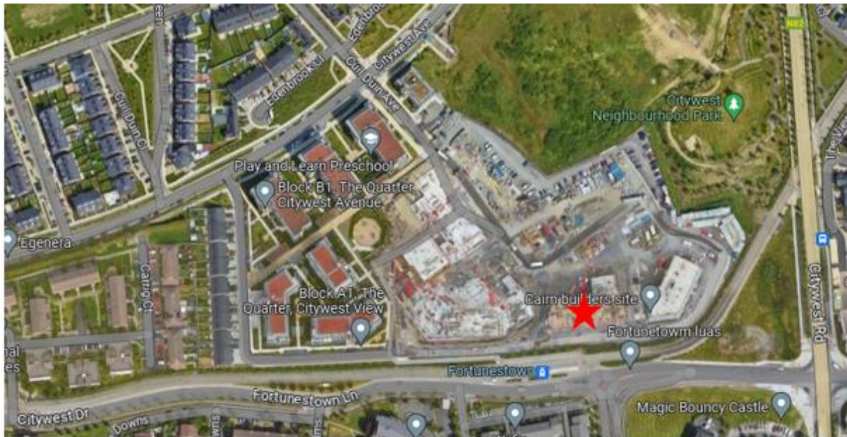
Figure 1 Site location – red star

Tramway Lane (Block E1 of SHD Permission ABP-310570-21) is located to the southern end of the permitted development site, immediately to the north of the redline line luas stop, Fortunestown Lane. It is located along the southern road into the site. The subject application site is c. 194.6 sqm and is an irregular shape.