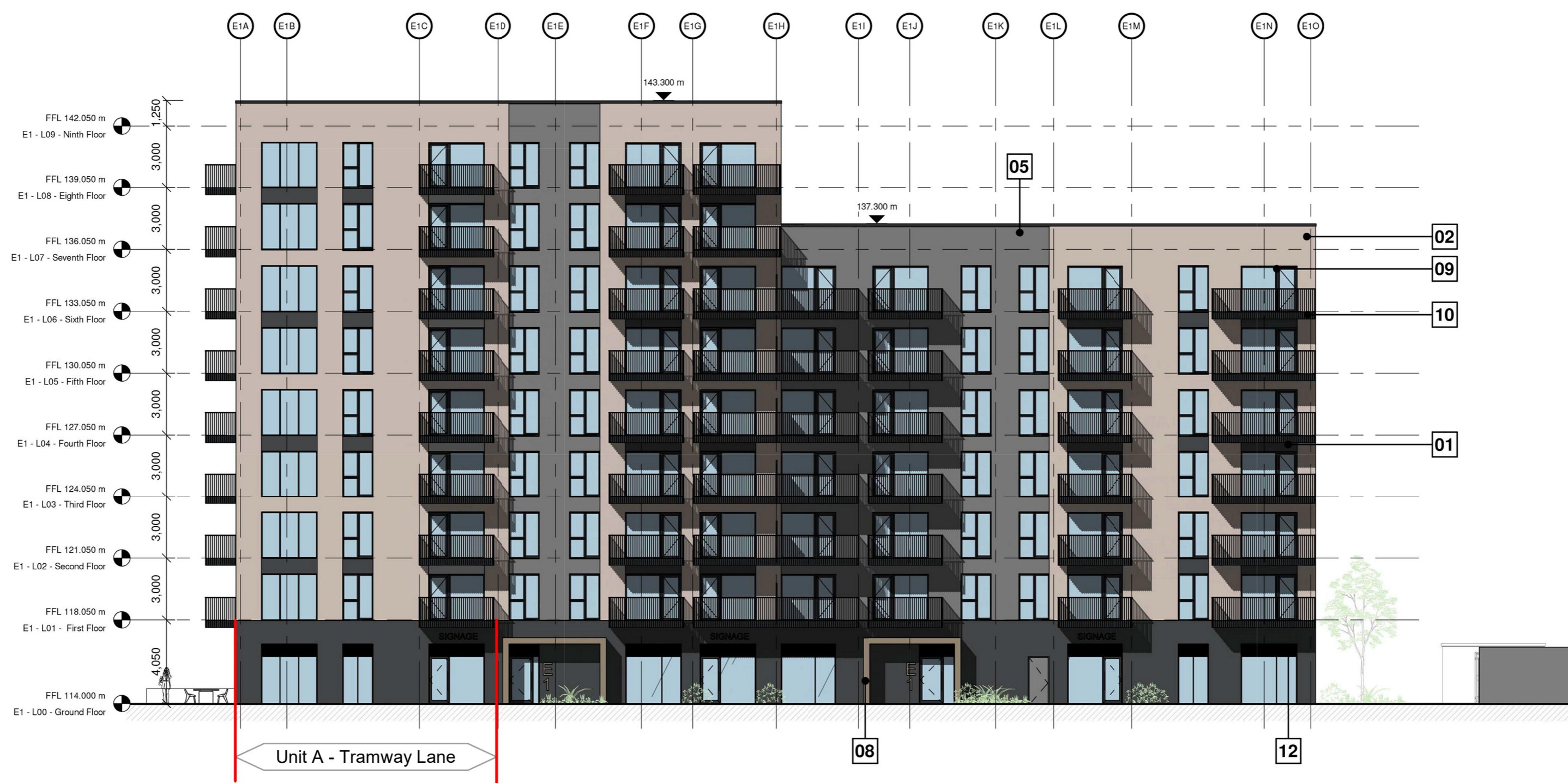
1 South Elevation - Unit A - Permitted under ABP-310570-21 1: 200