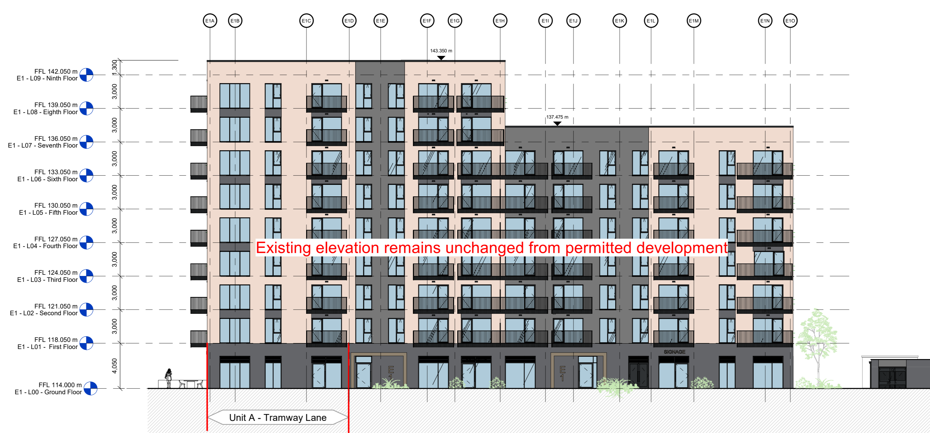
2 South Elevation - Proposed Unit A Tramway Lane 1: 200